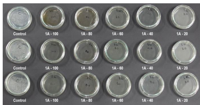
Figure 3: Photographs of the antibacterial test results of AgNPs at 100, 80, 60, 40 and 20% , made by triplicate.