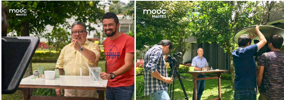
Videos recorded: homemade hygrometer