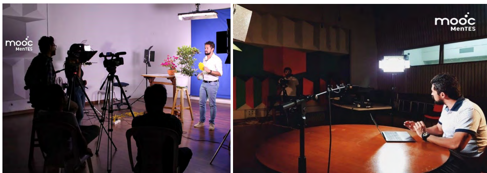
Videos recorded: Temperature

In addition, figure 2 (a) depicts the video recorded in the television studio of the “Temperature” unit, and figure 2 (b) shows the video recording of the “Agro Climate” unit. These videos were recorded by Ph. D. David Camilo Corrales.